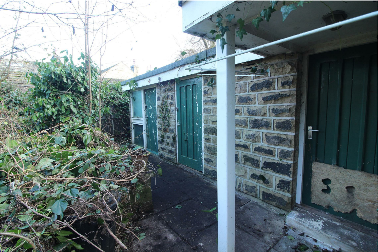
PORCH 5'3" apx x 3'9" apx