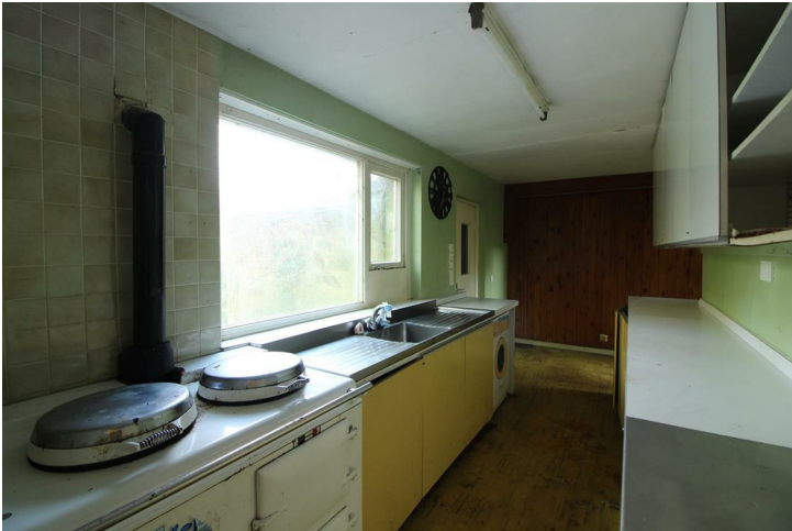
DINING KITCHEN 18'11" apx x 9'10" max